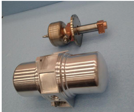
Figure 1. Photograph of RAM-100 Compressor and Expander.

Unit production and assembly of the RAM TMU is straight-forward and efficient, minimizing unnecessary critical path steps. Fabrication of the initial unit was completed very quickly with assembly of the compressor module requiring less than a week, including all curing, bake-out, and